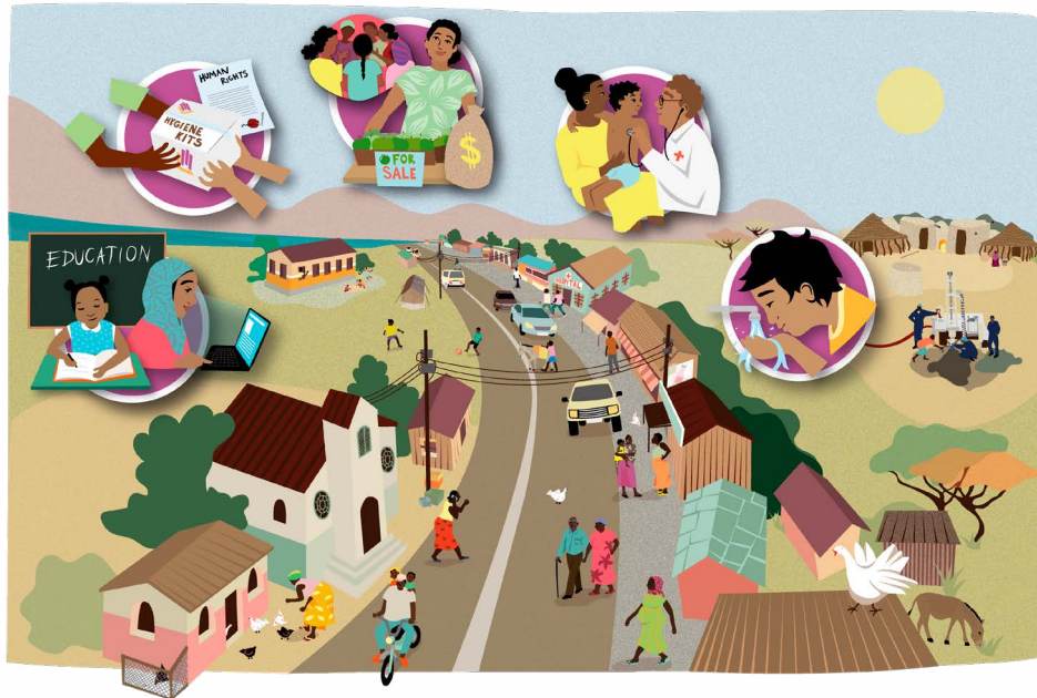
ILLUSTRATION: KRISTINE WIDLERT