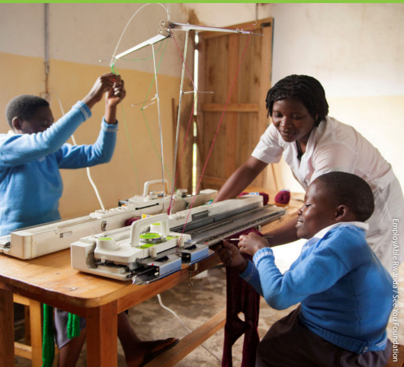
EmployAble Rwanda / SeeYou Foundation

The diversity of experiences the network can pull together makes partnering with EU-CORD unique.